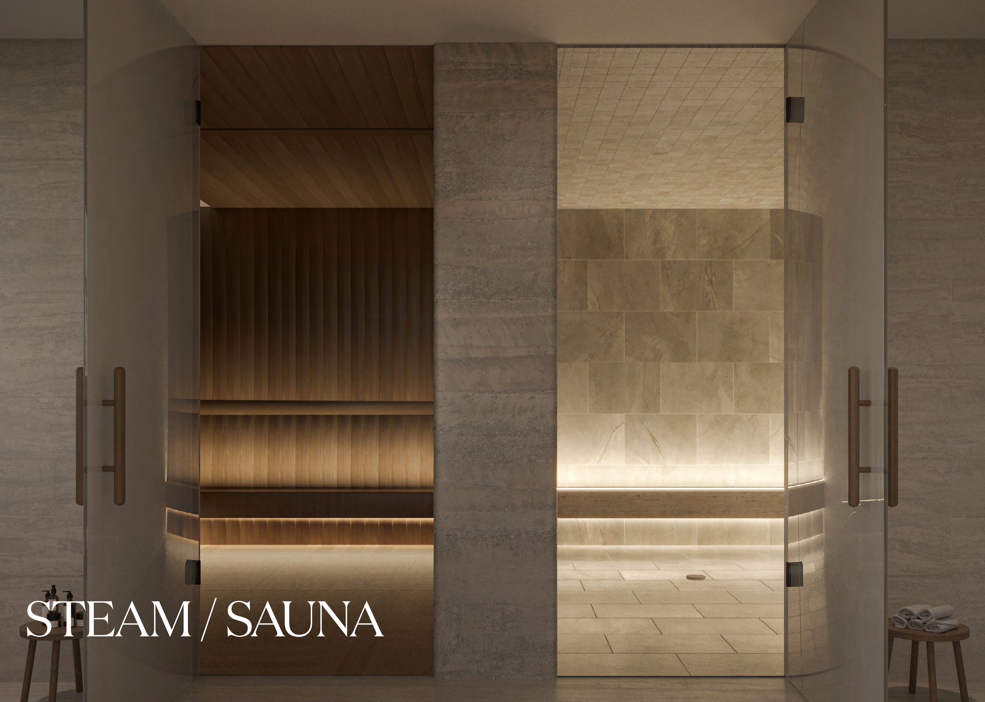
STEAM / SAUNA